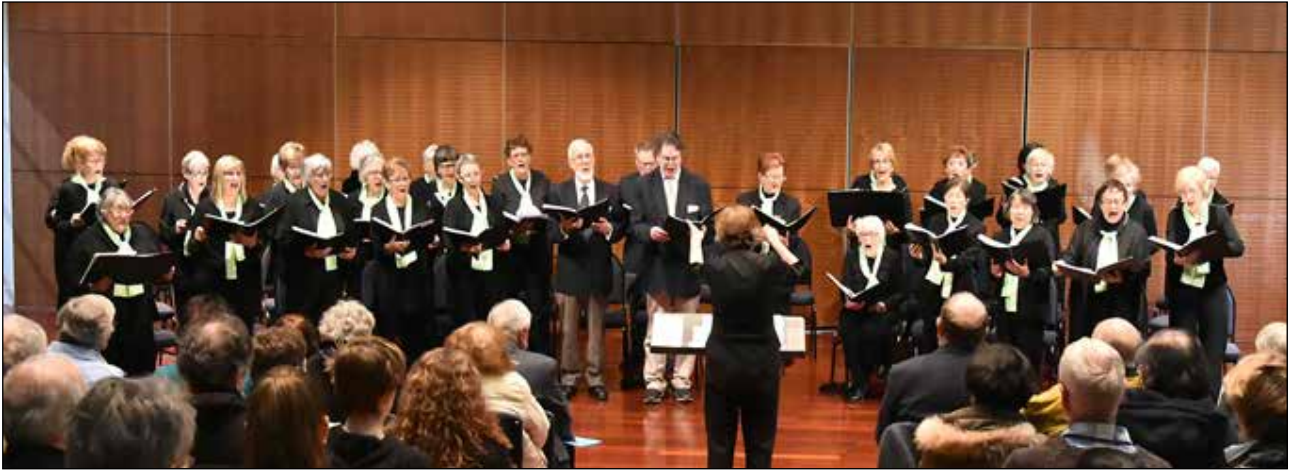
The Hawthorn U3A Choir in action